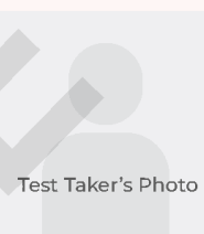
Test Taker's Photo

achieved the following scores on the LANGUAGECERT Test of English A1-C2 (Listening, Reading)